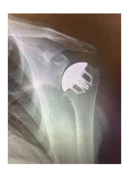
Shoulder Hemiarthroplasty Total Shoulder Arthroplasty

Reverse Total Shoulder Arthroplasty - in this procedure, the ball and socket are "reversed" compared to a standard total shoulder arthroplasty. The metal ball is fixed to the glenoid and the plastic cup is fixed to the top of the humerus.