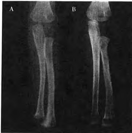
Figure 2. Radiographic changes of childhood hypophosphatasia (HPP). (A) Metaphyseal irregularity, patchy osteosclerosis, and "tongues of radiolucency" characteristic of childhood HPP are present in the right distal radius and ulna of this boy at age 16 months. (B) Radiolucencies in childhood HPP that are concerning for leukemia are seen here in a different patient. Before referral, he underwent extensive oncologic evaluation at age 8 months because radiographs showed unusual "osteolytic" areas. Here, the metaphyses of the right distal radius and ulna are expanded and osteopenic but with ragged yet well-demarcated transition to irregularly hypomineralized diaphyses. The same process, although less striking, appears at his elbow. These abnormalities were subsequently explained by HPP.

of cranial sutures may raise intracranial pressure. Abnormalities may improve with growth plate closure after puberty (Fig. 3). Rarely, there is widespread bone marrow edema (Fig. 4).