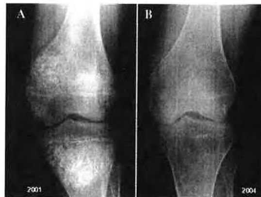
Figure 3. Spontaneous improvement in childhood HPP at maturity. (A) The left knee of a patient with childhood HPP shows considerable "popcorn calcification" with metaphyseal sclerosis as well as irregularity of his growth plates at age 17 years. (B) The abnormalities improved spontaneously by age 20 years.

In infantile HPP, hypercalcemia and hyperphosphatemia are common. 24,30 This seems largely from impaired calcium and P_i uptake by a poorly growing and mineralizing skeleton. Low serum parathyroid