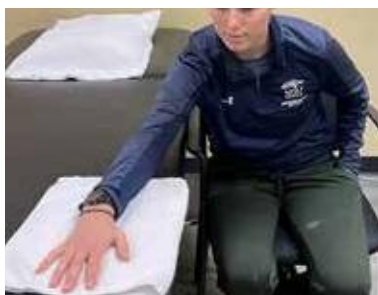
TABLE SLIDE FLEXION

Sit in a chair and place your affected arm on the table. Slowly slide arm forward until a stretch is felt. Hold, then return to starting position and repeat. It is ok to gently lean forward with your body.