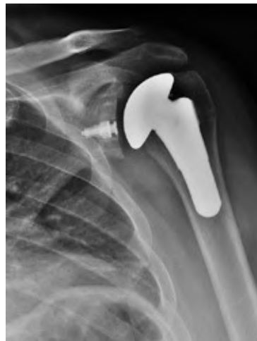
Total Shoulder Arthroplasty