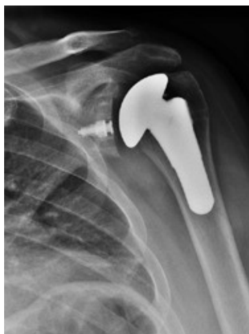
Total Shoulder Arthroplasty