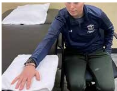
TABLE SLIDE FLEXION

Sit in a chair and place your affected arm on the table. Slowly slide arm forward until a stretch is felt. Hold, then return to starting position and repeat. It is ok to gently lean forward with your body.