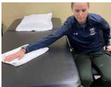
TABLE SLIDE SCAPTION

2 sets, 10 repetitions, hold 10 seconds. 1-2x/day